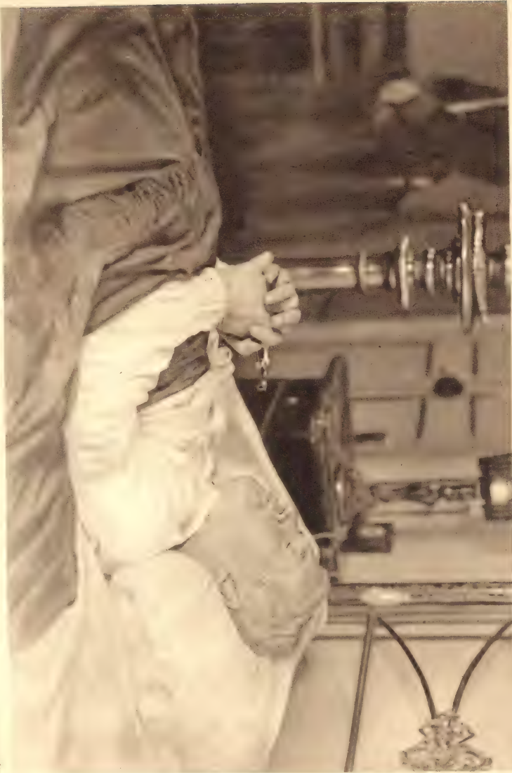
THE PEACE OF CHRIST